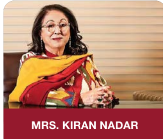
MRS. KIRAN NADAR

Founder – HCL Chairperson Emeritus & Strategic Advisor – HCL Tech Founder & Chairman – Shiv Nadar Foundation