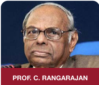
PROF. C. RANGARAJAN

Chairman – Madras School of Economics Chancellor – University of Hyderabad Ex-Governor - RBI Former President : Indian Statistical Inst.